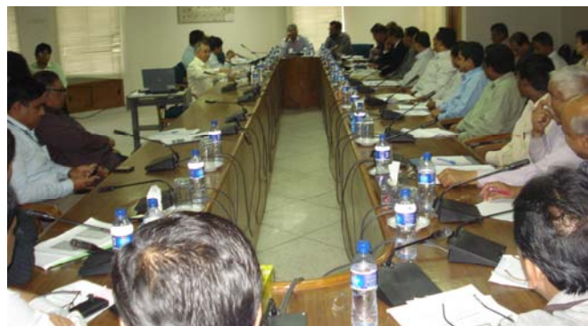
PKSF high officials and DIISP lead consultant participated in the seminar on 'Micro-insurance Demand and Market Assessment Survey'

which was on average more than 41%. Households had to bear on average about BDT 10,000 to face these shocks in the last two years.