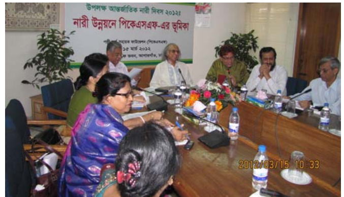
PKSf officials and others participants in the seminar

It is expected that inheriting its two decades success, PKSf will continue its incessant effort to provide wide ranging services including education, capacity building training, health care services, capital flow, natural and social environment, values, creation of opportunities along with freedom to undertake potential opportunities with the aim of ensuring human development of the underprivileged people particularly women.