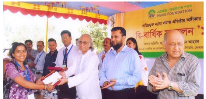
PKSF Chairman and high officials attended the biennial conference of "WAVE Foundation"