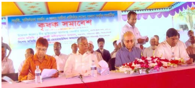
PKSF high officials at the 'Farmers Forum' of Shojag

A recent research has shown that malnutrition has increased and if the acceleration of malnutrition persists then food security won't be effective anymore. Therefore, quality of agricultural food must not be compromised. According to him, activation of farmer-friendly awareness campaigns can be effective to guarantee food quality and organizations like 'Shojag' should look after the food security of local people.