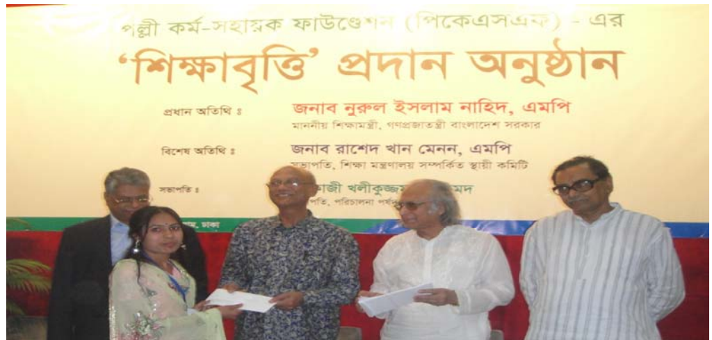
Hon'ble Education Minister Mr. Nurul Islam Nahid is handing over a cheque of education scholarship to a student