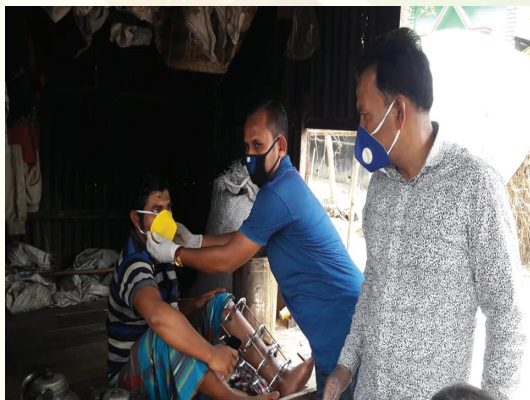
Face mask distribution and awareness building about hand washing and social distancing conducted by Bishnandi Union ENRICH team in Narayanganj district