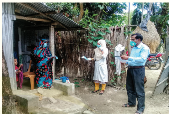
Community health awareness activities through leaflet distribution in Kalipur Union, in Chattogram district where ENRICH is being implemented by PKSF-PO 'Uddipan'.

COVID-19 has spread over many countries in the world and at the same time a lot of rumors and misinformation have also been spread. Risk communication and community engagement activities are one of the most significant priorities for battling the misinformation. In Bangladesh, an overpopulated country, it was a big challenge to make people aware about COVID-19 and the relevant health protocols. Initially, it appeared that social distancing is tough while taking public commutes and living in the rural areas. In the context of massively populated and lower-middle-income countries like Bangladesh and rural areas where a significant proportion of the total population lives hand to mouth, it was difficult for them to survive with no savings and work, no health service and assistance. In ENRICH Unions, the program came forward with different activities during the COVID-19 crisis. These include community awareness sessions, neighborhood-based interpersonal sessions, distribution of daily commodities and financial assistance. Glimpses of some of these activities are as follows.