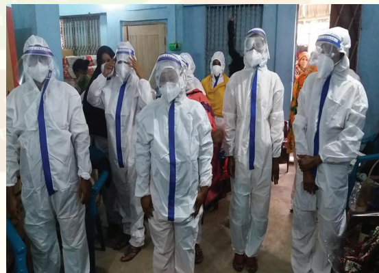
ENRICH health service providing personnel prepare themselves to ensure continuous support to the COVID-affected people.