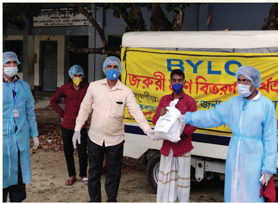
An ENRICH youth forum under BASA distributing daily commodities for free among those in need in Durgapur Union of Gazipur.