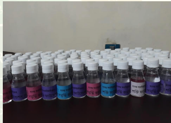
Bottles of hand sanitizers ready for distribution during the COVID-19 pandemic under ENRICH program in Majidpur Union, Comilla by Shakti Foundation.