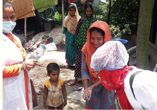
Community health awareness activities through hand washing training in Kalipur Union, where ENRICH is being implemented by PKSF-PO Uddipan.