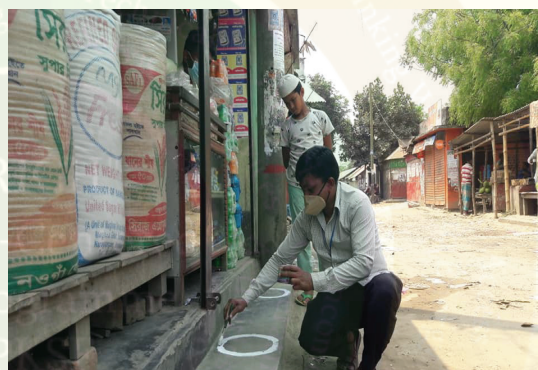
Painting social distancing circle in a public place as a part of awareness activities during COVID-19 pandemic in Bishnandi union, Narayanganj.