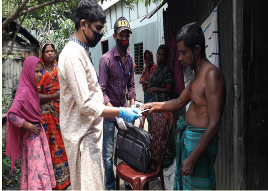
Financial assistance to a home-stuck ultra-poor family during the general holidays in Bishnandi Union, Narayanganj where CEDER, a PKSF PO, implements the ENRICH program.