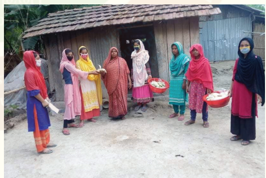
Daily commodities and food assistance during the COVID-triggered general holidays for ultra-poor families by ENRICH youth forum in Alangi Union of Jhinahaha District.