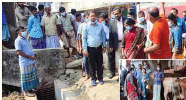
Inspection of hygienic cattle waste disposal system