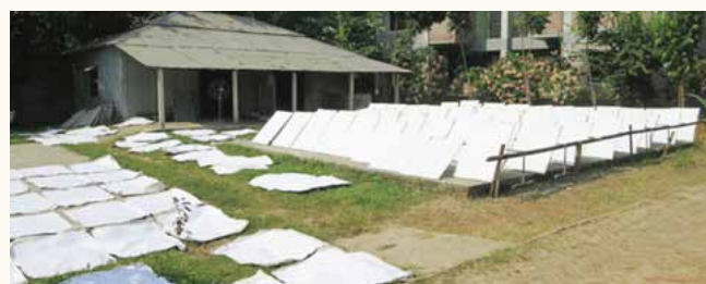
Sheets of handmade paper being dried in the sun

collaborate with other institutes like universities, government offices and private offices for this initiative.