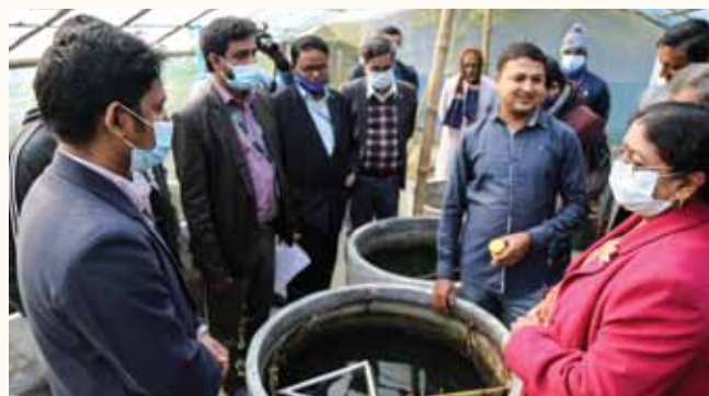
The PKSf Managing Director visiting an ornamental fish farm