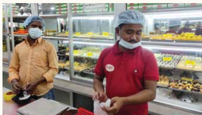
Microenterprises following necessary health protocols

Crops and Horticulture: PKSF has approved 19 value chain sub-projects in crops and horticulture sector under the RMTP project. Through these sub-projects, 1.2 lac farmers and small entrepreneurs from 53 upazilas of 36 districts will