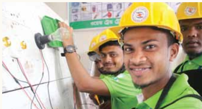
Happy faces at an electrical house wiring training session

PKSF plans to provide financial services to 1.75 lac youths and microentrepreneurs from various business clusters in urban and peri-urban areas to increase their employability and productivity under the RAISE project to be implemented through 70 Partner Organizations (POs) in the field. Of them, microentrepreneurs adversely affected by the Covid-19 pandemic will get flexible credit services to revive their business activities. PKSf will arrange training on sustainable microenterprise management, skills development for young entrepreneurs, and foreign language training for technically