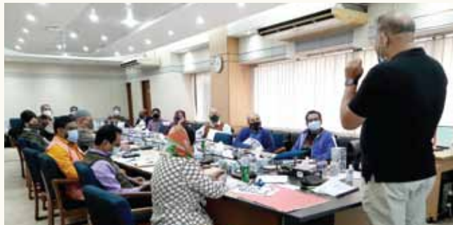
Internal training for PKSf officials underway