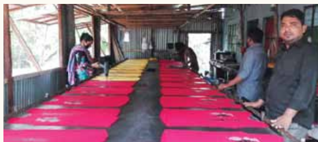
Screen printing underway at a microenterprise