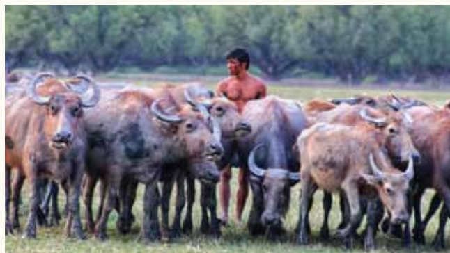
Buffalo rearing in coastal areas

PKSF is implementing value chain and technology transfer sub-projects under the PACE project. Under value chain