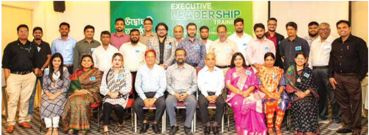
Participants of 'Executive Leadership Training' pose with PKSF officials

Training for PKSF Officials: In October–December 2022, a total of 22 PKSF officials attended training and exposure visit programs organized by the United Nations Framework Convention on Climate Change (UNFCCC), the International Fund for Agricultural Development (IFAD), the Danish International Development Agency (DANIDA) and the Asian Institute of Technology (AIT). In addition, 123 officers participated in different training programs, seminars and workshops in this quarter.