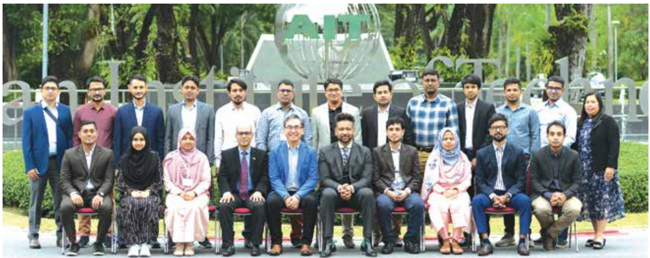
PKSF officials during a training program at the Asian Institute of Technology (AIT), Bangkok, Thailand

Internships: In this quarter, three students from different Universities completed their internships. Besides, eleven students are currently pursuing their internships at PKSF.