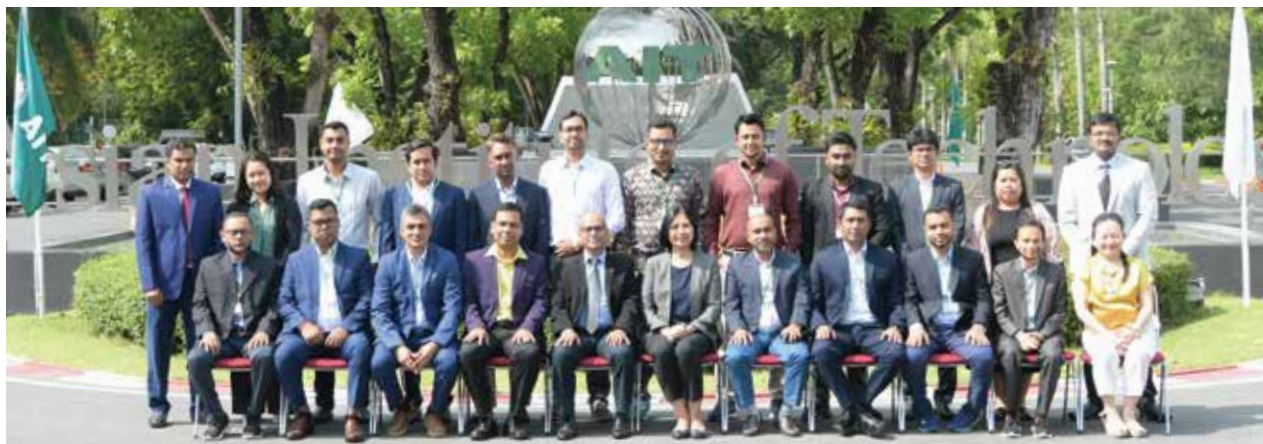
Participants of a training course titled 'Climate-Resilient Agriculture & Sustainable Farming', conducted by the Asian Institute of Technology (AIT) in Thailand from 21-28 May 2023

In this quarter, a total of 45 PKSf officials participated in different training programs, workshops, conferences and orientation programs within Bangladesh.