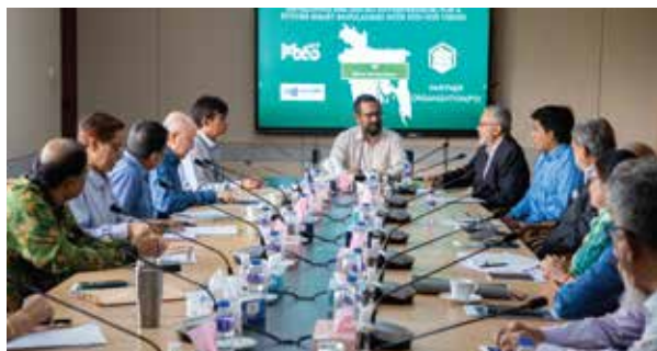
Coordination workshop: A coordination workshop was organized at PKSF Bhaban on 7 May 2023 to promote

In addition to providing financial services to microenterprises (MEs), the Promoting Agricultural Commercialization and Enterprises (PACE) project has so far implemented 79 value chain sub-projects in various potential farm and non-farm sub-sectors. Of them, 46 are currently under implementation in the field. Over 7 lakh micro-entrepreneurs and other value chain actors are receiving technical, technological and marketing support through these sub-projects of PACE, co-financed by PKSF and the International Fund for Agricultural Development (IFAD).