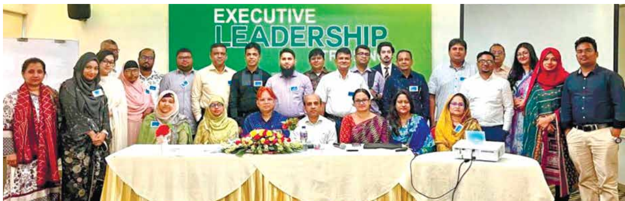
Trainees of an 'Executive Leadership Training' course, conducted from 5-7 June 2023, pose with PKSf high officials

Regular training activities: PKSf's Training Cell provides nine class-based training courses. During the April-June 2023 quarter, 126 officials of PKSf's Partner Organizations (POs) took these courses. The total number of individuals receiving the training in different batches in the current fiscal year stands at 503.