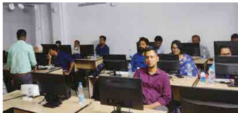
20 officials of PKSf participated in a training course on Graphic Design from 10 July to 3 August 2023.

In-Country Training: In this quarter, a total of 424 PKSf officials (one official participating in more than one training) participated in different training programs and orientation programs at different training institutes and PKSf Bhaban.