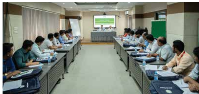
A session of a training course on 'Procurement and inventory management' underway at PKSF Bhaban

From April to June 2024, a total of 14 officials attended training programs and workshops in Germany, China and Tanzania. These programs were organized by the Adaptation Fund Board Secretariat and the National Environment Management Council (NEMC), the United Nations Framework Convention on Climate Change (UNFCCC), and the Asian Institute of Technology (AIT) in Thailand. Additionally, 140 PKSF officials participated in various training programs and workshops organized at PKSF Bhaban and other institutions within the country.