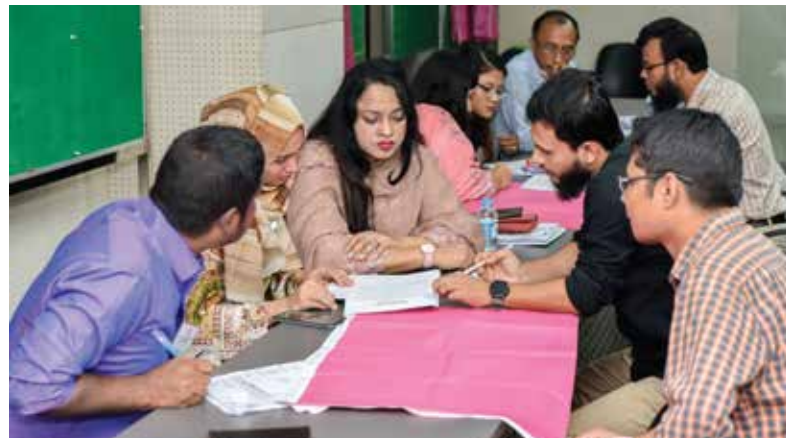
Officials of POs attending a training course on 'Human Resource Management'.